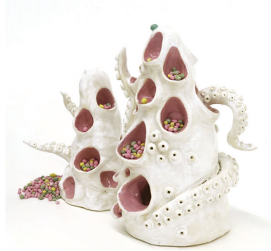
WHITE RABBIT BLACK SWAN Midori Goto