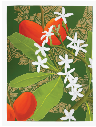
NEISOSPERMA KILNERI - ORNATE-FRUITED NEISOSPERMA Dylan Mooney