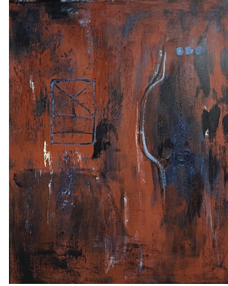
SHAMEFUL ACT THIS TIME WITH A HAPPY FACE 1 Ratul Alam