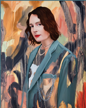
Cover Art: HOLT - Kim Leutwyler

"Pride Without Borders" is more than an art exhibition; it is a statement of solidarity and a beacon of inclusivity. We stand together, proud and unapologetic, celebrating love and identity in all its forms. Together with our colleagues and our clients, let's create a world where pride knows no borders