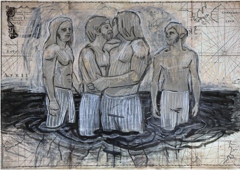
1727; PIETER FOR ADRIAAN Todd Fuller