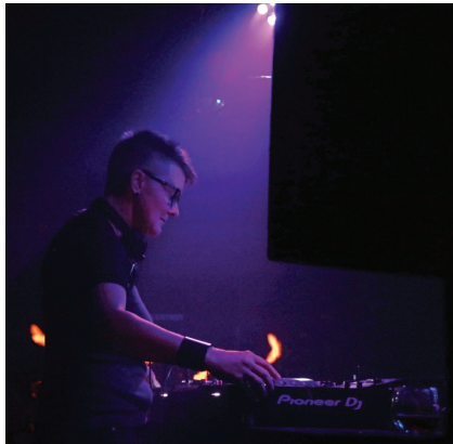
MUSIC BY MEL FITZPATRICK